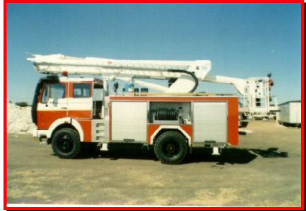
Harbour and Airport Security