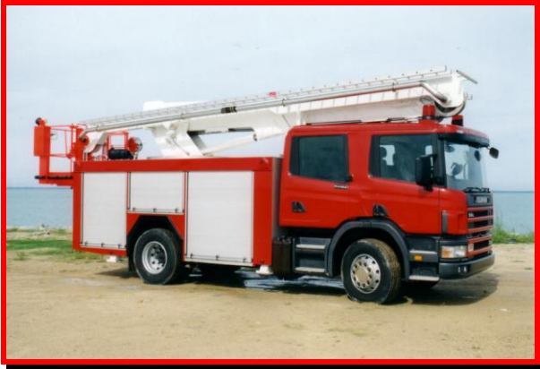
City and Town Fire & Rescue

A range of either 2 or 3 boom articulated rugged fire fighting aerials