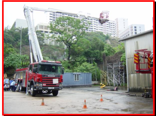
Petro-Chem and Factory High Capacity Water operation Up and over obstacles