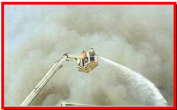
High Volume water and foam monitors with remote control options

Large high strength stainless steel cage with 4 doors and space to enter wheelchair, water monitor and water hose connection(s)