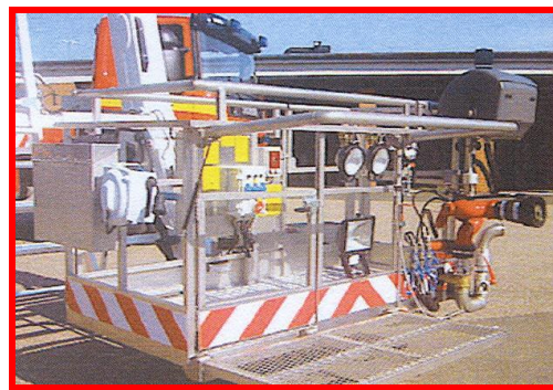
Superb cage access at ground level with fold-down front platform for stretcher & wheelchair rescue with room for 5 adults