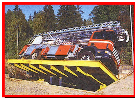
Rigorous testing to the highest international standards