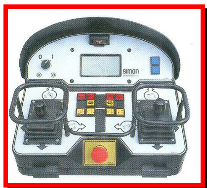
Full control of all cage movements and machine functions. User-friendly and easy to operate.