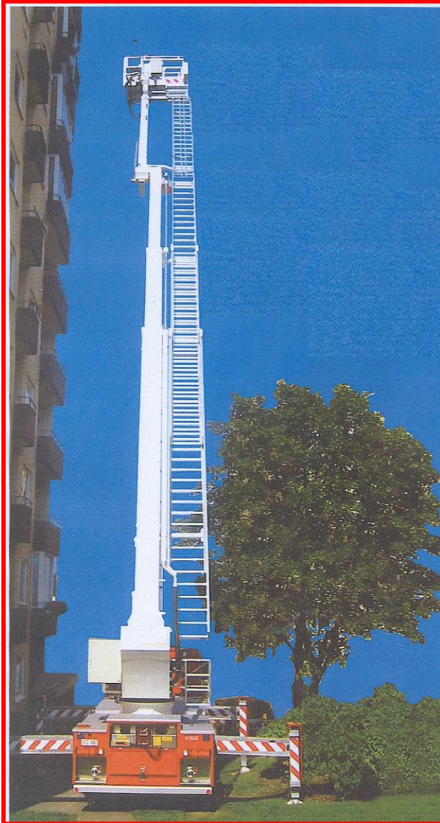
Pinpoint Accuracy – Safe & Effective Fire Fighting