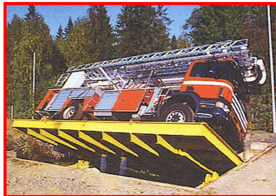
Rigorous testing to the highest international standards