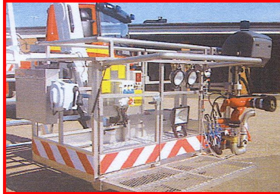
Superb cage access at ground level with fold-down front platform for stretcher & wheelchair rescue with room for 5 adults