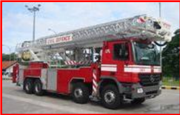
SF-550 on Mercedes Actros chassis with custom fire engineering bodywork and fixed pump installation

Large high strength stainless steel cage with 4 doors and space to enter wheelchair, water monitor and water hose connection(s)