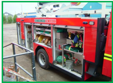
Compartments are configured to suit user's needs with multiple storage options