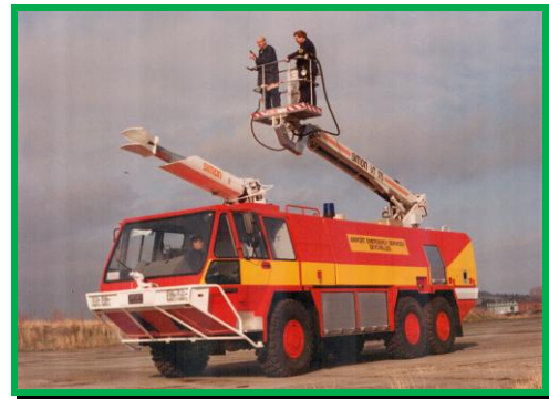
Multiple compartments giving many storage options