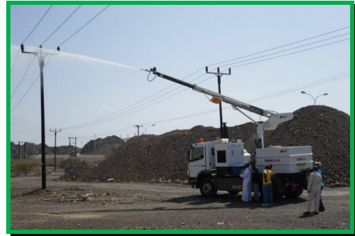
Zero front and rear overhangs