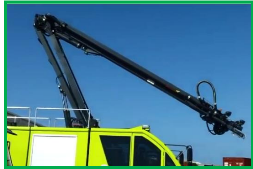
Integral water tank and fire pump offer a Quint style multi-functional vehicle