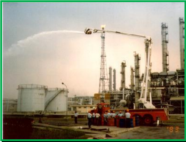
Articulated, Telescopic and Combined Boom Configurations